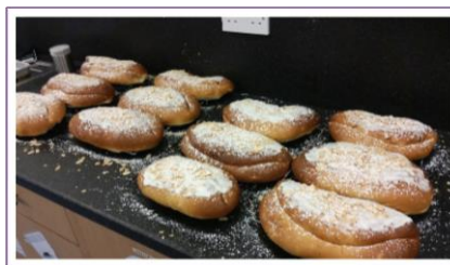
From the Bakery group...

The Heathlands Bakery now runs 3 days per week, baking all manner of breads, cakes, pies and biscuits. In the near future we expect to be making produce for outside groups as well as for ourselves, friends and family. All members enjoy their time in the bakery, learning skills and recipes that they can use at home.