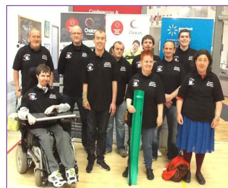
The team at Greenbank Sports Centre in Liverpool for the Northwest Regional Boccia Tournament