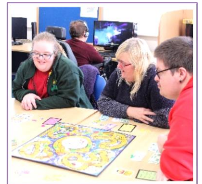
Playing board games in the Gaming group