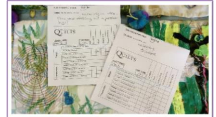
Feedback from the Festival of Quilt judges