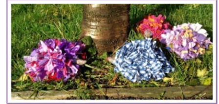
Rag Rug Hedgehogs made by OCN Seasonal Crafts Group

If anyone has any Board Games/Card Games/Console Games or other types of games they would like to donate to the project they would be gratefully received. Thank you!