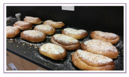
From the Bakery group...