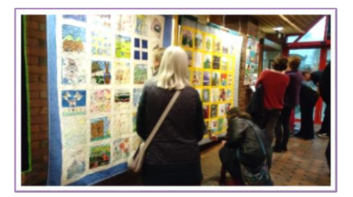
People admiring the Cumbria Quilts at Tullie House