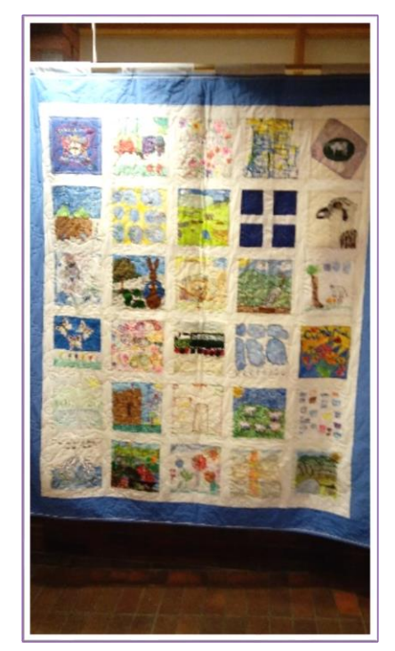
Our Heathlands patches made into one of the Cumbria Quilts