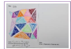
A Design for the Two Halves Postcard project