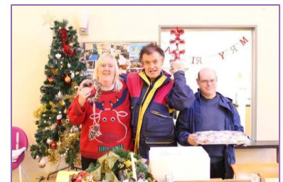
Offering a helping hand at Water Street Hostel