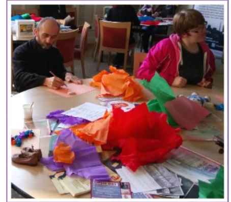
Enjoying some collage at the Arts and Health Symposium