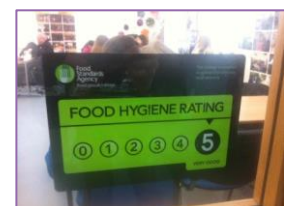
Five Star Food Hygiene rating