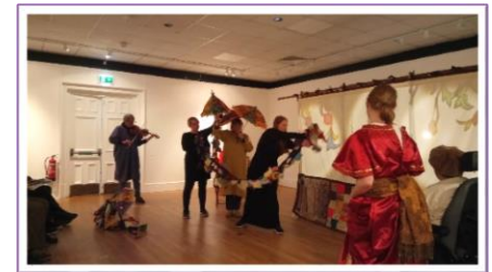
Watching Prism Arts 'Shadow Tales' performance