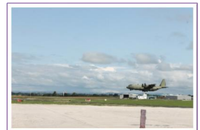
A grand day out at Carlisle Airport

If you have any comments or something you'd like included in the next newsletter please email it to helen.walsh@lbtuk.org by October 20 th