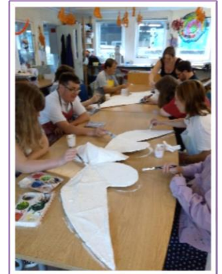
Working hard making moths